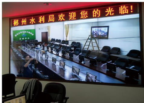
Water Conservancy Industry